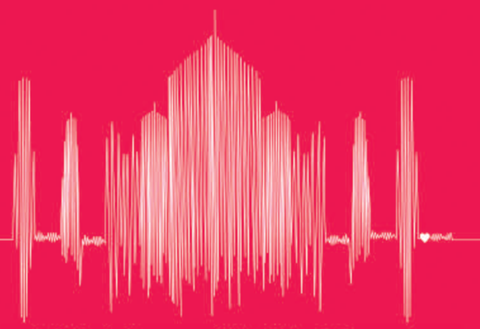
59th All India Congress of Obstetrics & Gynaecology